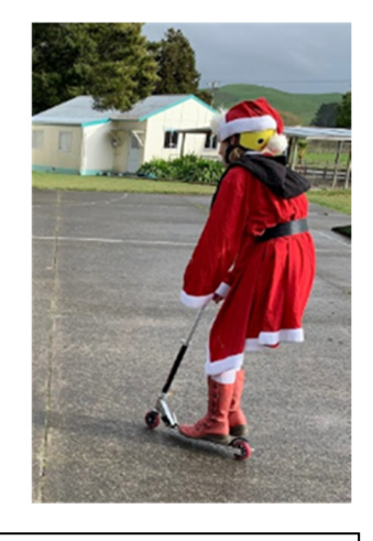
A visit from Mrs Claus for Endeavour's mid-winter Christmas.